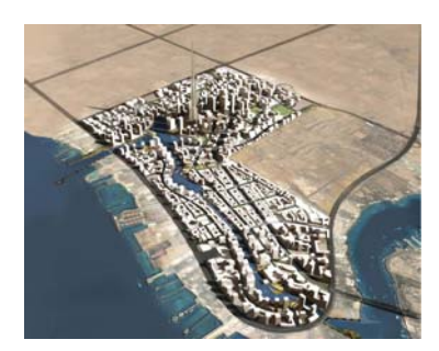
Kingdom Tower Development