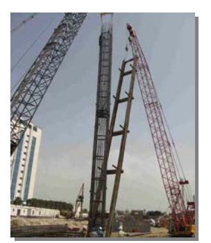
Lifting of O-cell assembly prior to installation