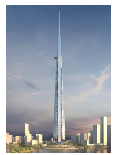
1000 m high World's Tallest Tower