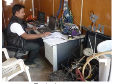
Testing in progress